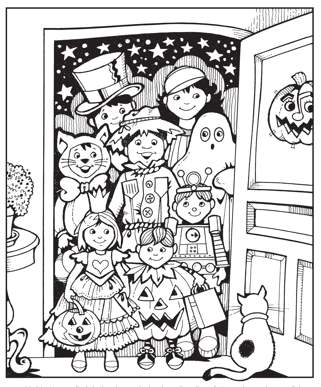
In this big picture, find the bowl, spatula, book, mallet, slice of pie, apple, mushroom, fish, flag, adhesive bandage, boomerang, snake, paper airplane, musical note, barbell, funnel, drinking straw, and artist's brush.