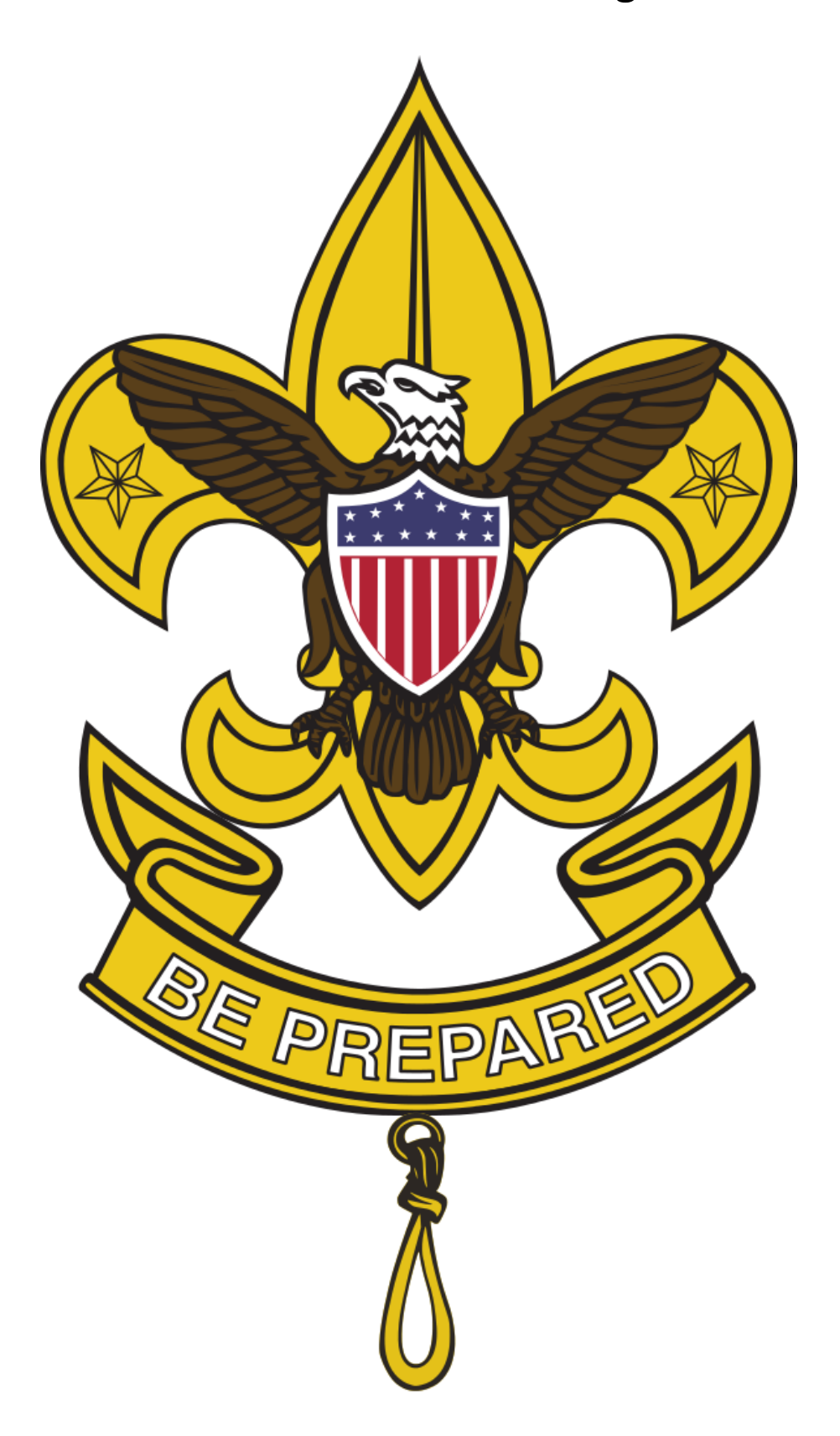
The First Class Scout Badge